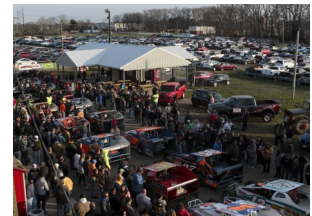
Racing action at Grandview (L), and Bridgeport